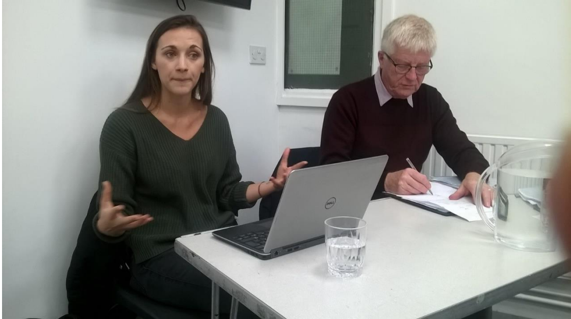
Grace expands on a point

Labour rode this bandwagon, as the increased tax take paid for more public services. Finance institutions operated at a level above government influence and in their own interest, with limited and often ineffectual regulation.